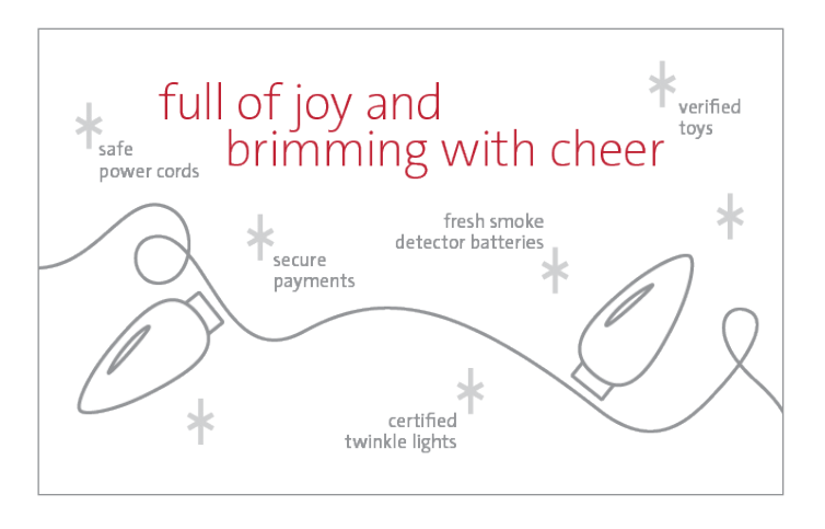
Small stars and their labels sparkle in and out. Illustration animates back in to complete the loop.