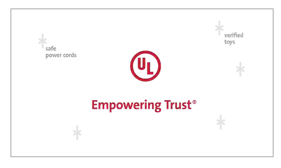
Our usual end card — with the addition of twinkling safety stars around the edges.