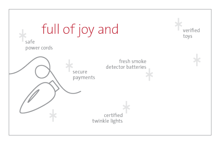
Large illustration animates out.

Opening frame shows twinkling safety stars from the printed card.