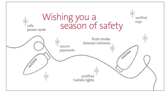
Illustrated light draws in. Stars labeled with highlights of holiday season safety twinkle in.