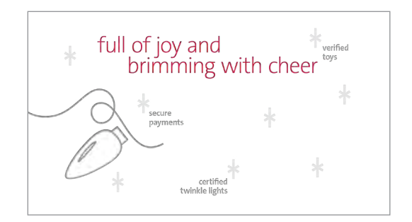
UL's take on "season's greetings," surrounded by twinkling safety stars.